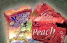
Carrier Stock (soda can carrying cases, cereal boxes)