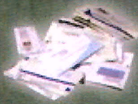
Junk Mail & Envelopes