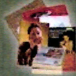
Magazines, Catalogs & Telephone Books