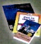
Paper Back Books (no hard cover books)