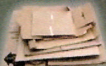
Cardboard (no waxed cardboard)