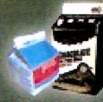
Gable Top Containers (milk and juice cartons)