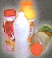
Milk and Juice Jugs