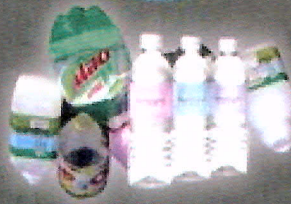
Soda, Water & Flavored Beverage Bottles