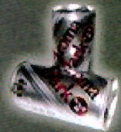
Aluminum Cans, Trays & Foil