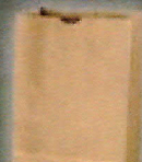
Kraft (brown paper) Bags