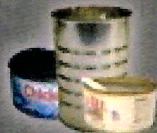
Steel Cans and Tins