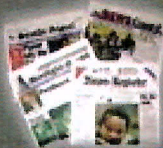
Newspaper, including inserts (remove plastic sleeves)